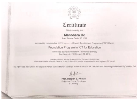
Fig shows faculty certification in ICT/NPTEL Training